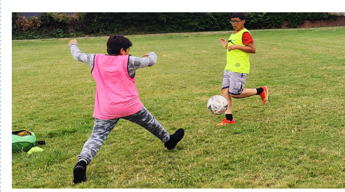
Football for Girls & Boys Every Sunday at 11am July 16, 23, 30. 2023 August 6, 13, 20. 2023

Youth Games Drop-in Every Sunday 12-3 pm July 16, 23, 30. 2023 August 6, 13, 20. 2023