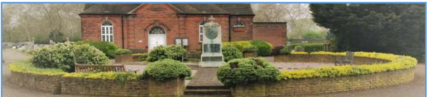
Grade II listed. Willesden Liberal Jewish Cemetery War Memorial.