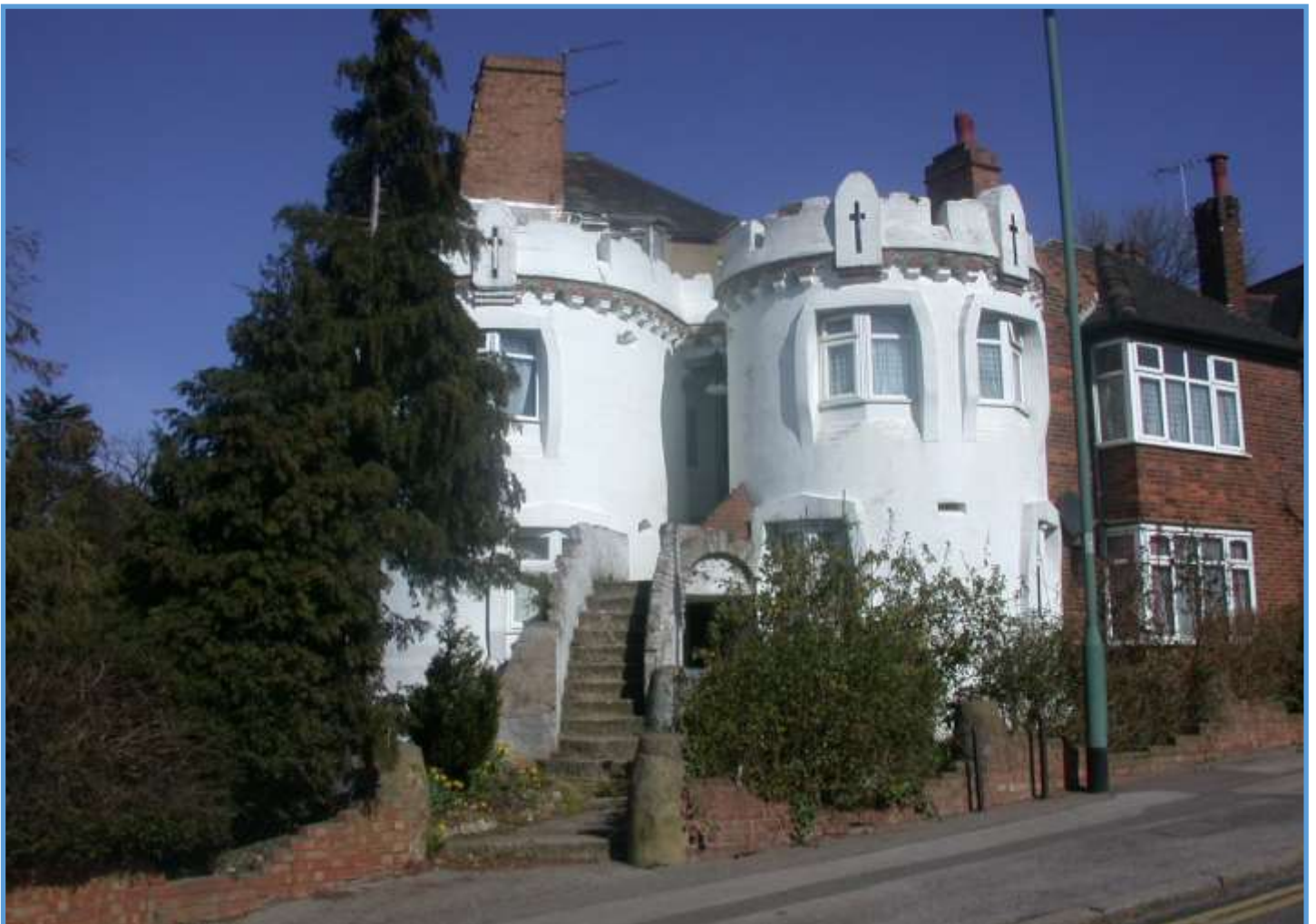
Local listed maisonettes in Wakemans Hill Avenue designed by Ernest George Trobridge in 1935. An iconic Trobridge 'castle', featuring rising entranceway steps between two drum towers.