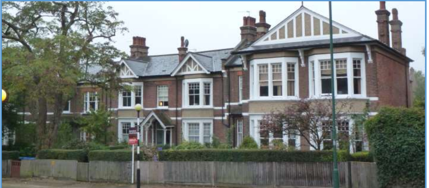
Proposed for Local List: Brondesbury Park Mansions, Salusbury road, NW6 6PD

Objective 3: Work with communities, residents' associations and local history societies to thematically identify potential candidates for the Local List, based on the Borough selection criteria.