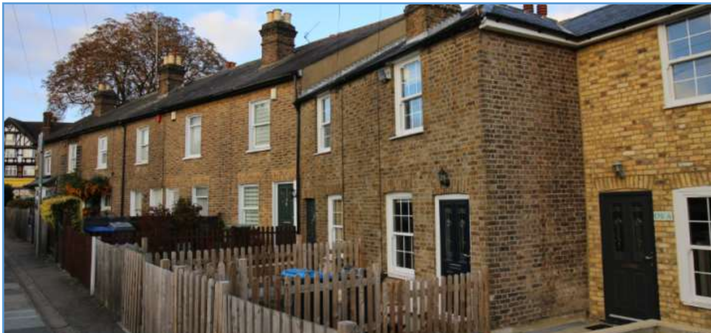
A modest group of C19 brick cottages in Watford Road, Sudbury.