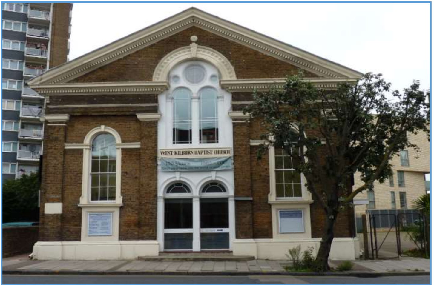
Locally listed. West Kilburn Baptist Church, 1865 by C Hall.

3.4 Supplementary Planning Documents (SPDs) and Guides provide guidance on the Council's planning policies and processes in conservation areas, and are capable of being 'material considerations' in determining planning applications. The Council has adopted a number of Conservation Area Guides and Character Appraisals for all its conservation areas. The need for individual Conservation Area Guides is discussed in relation to each individual conservation area contained within Appendix A. A review of the Character Appraisals is discussed in paragraph 18.4.