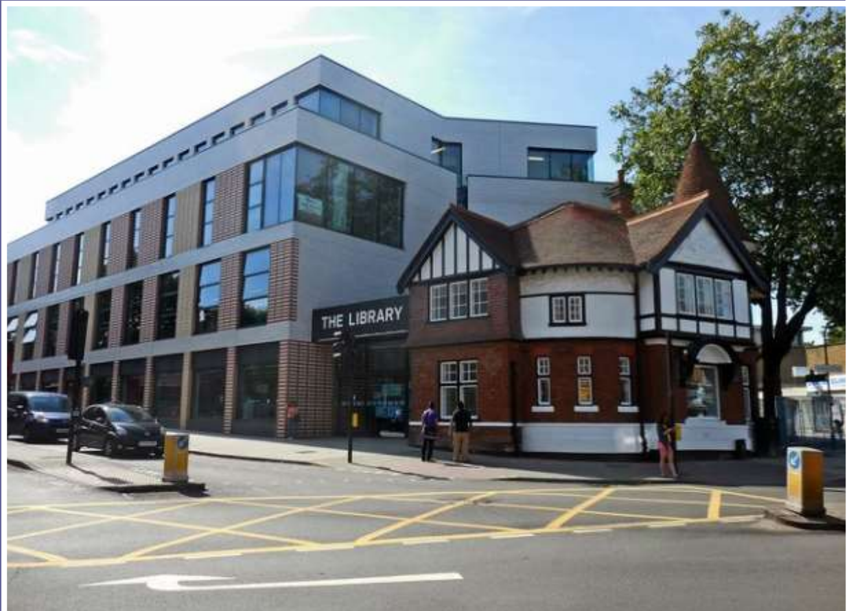
The Willesden Green Cultural Centre (2015) by Allford Hall Monaghan Morris returns to use the Locally listed Victorian Library blending perfectly the old and the new.

Assessing and managing Brent's built heritage to support good growth and help inform regeneration and place-making