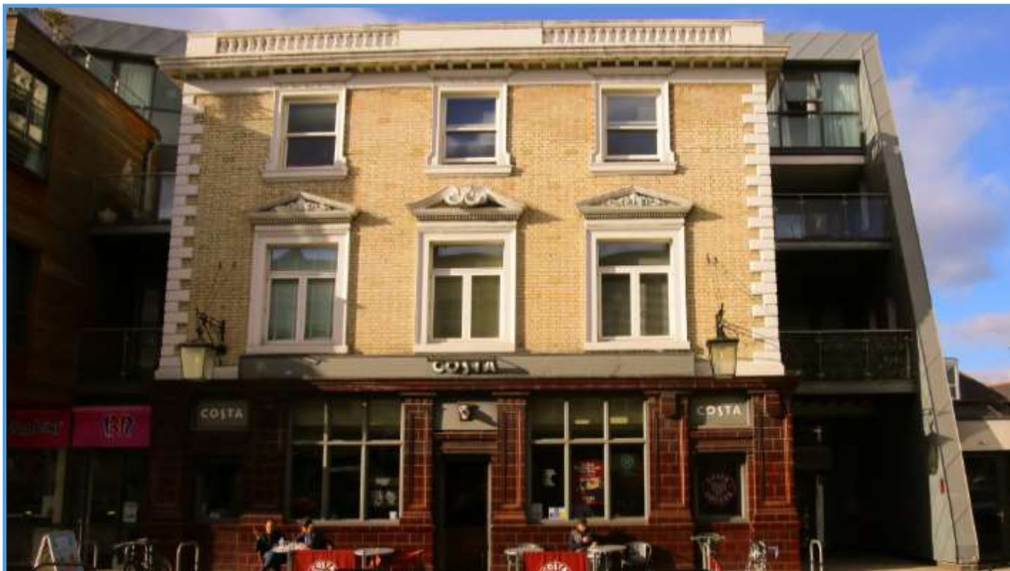
Locally listed former Spotted Dog Pub, High Road Willesden, 1881 by H W Hexton converted and extended for new uses in 2014.