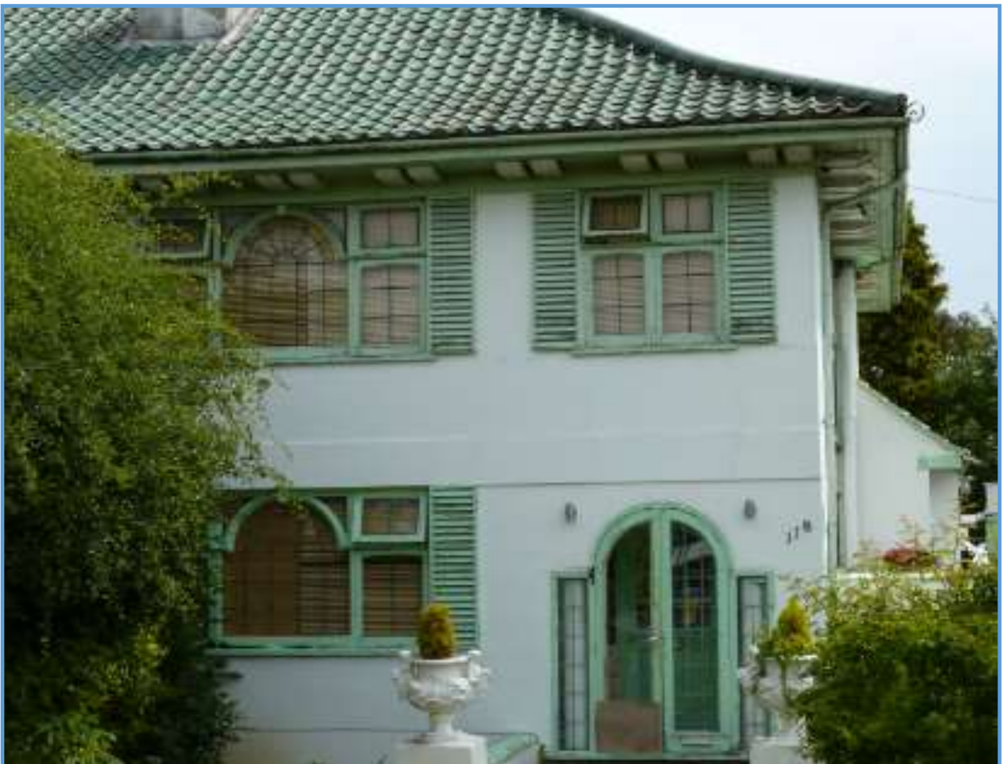
Moderne houses enlivened by bright green pan tiles in the Sudbury Court Conservation Area.