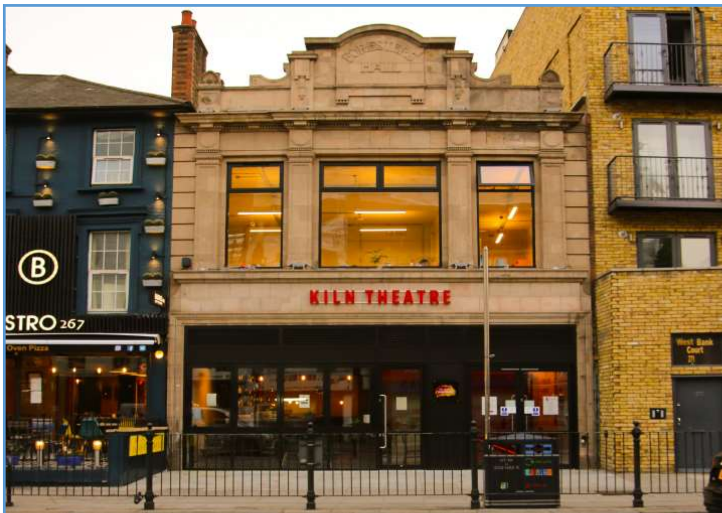
Locally listed Kiln Theatre on Kilburn High Road showing detail of the refurbished 1929 Foresters' Hall façade and new shopfront.