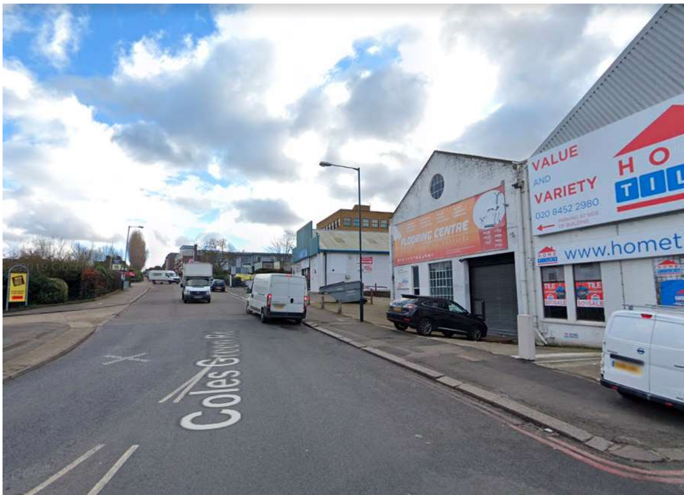
Image 1. Junction of Coles Green Road and North Circular, 2018. Location Ref NDH1. Copyright Google 2020. This image is for personal use only.