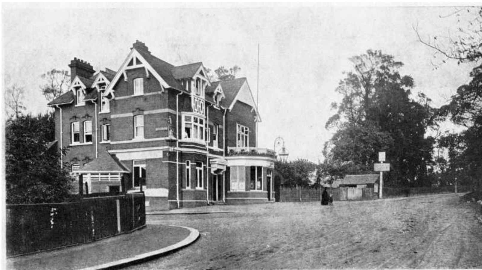
Ye Olde Spotted Dog, Neasden.

Image 20. 151 Neasden Lane, c. 1900s. The Old Spotted Dog pub. Location Ref NDH10. BMA Ref 1244. This image is for personal use only.