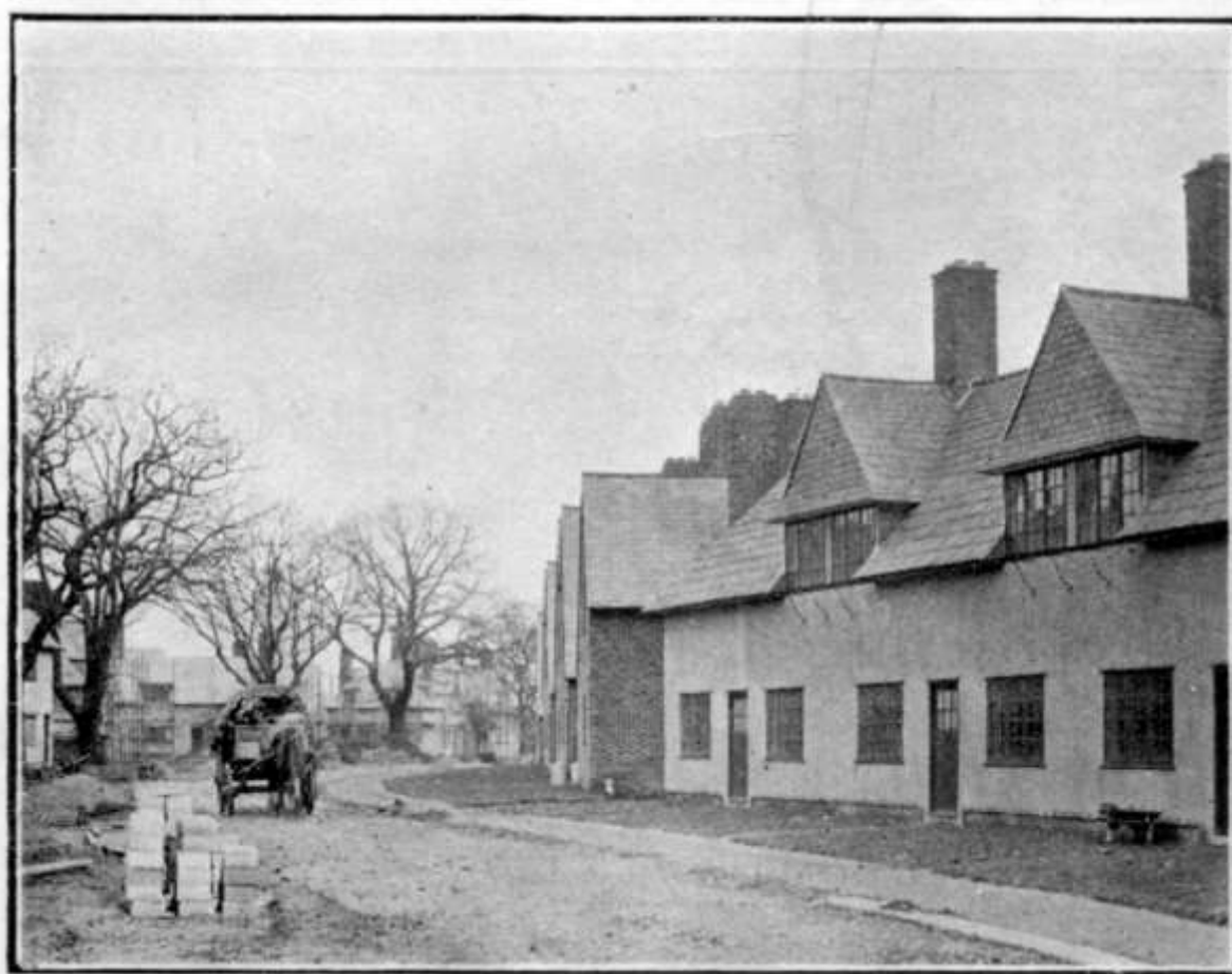
MAIN STREET, LOOKING EAST.

Location Ref KB8. BMA Ref 6173. This image is for personal use only.