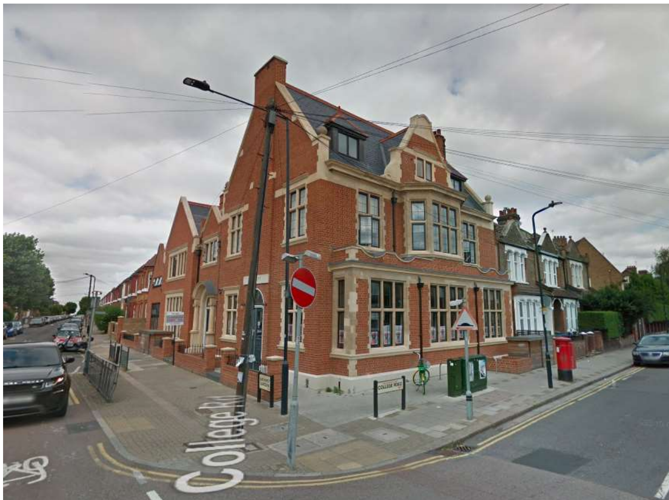
Image 1. Kensal Rise Library, Bathurst Gardens, 2019. Location Ref KG1. Copyright Google 2020. This image is for personal use only.