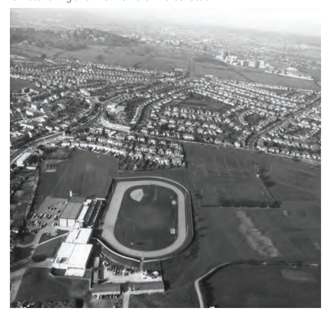
Aerial view of North Wembley - Vale Farm Sports Ground, Sudbury Court Estate behind, Harrow hill rear left 1983