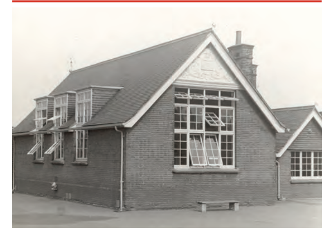
Sudbury Infants' School, January 1956

"It was much stricter when I was at school. Much stricter. We had a lot of respect for our teachers, um, I'd go as far as to say we were quite scared of some of them, really, they were strict and you sat... we had, I remember have being in a class of 45 children and we all sat behind a desk, in rows, and the teacher would be at front of the, um, the classroom, and you wouldn't hear a sound (...) you learnt your times tables, we all left school knowing our time tables up to twelve, times tables, all of them