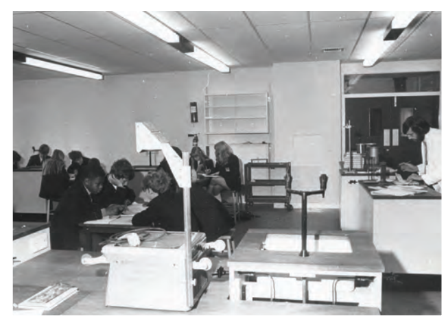
Wembley High School Science Laboratory