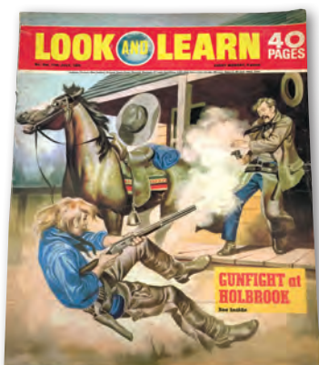
Look and Learn Magazine cover 1971

"Occasionally you'd get the odd um children's magazine as well which occasionally we were treated to, perhaps during the summer holidays (...) I remember there was one called Look and Learn, um, and that that was quite an