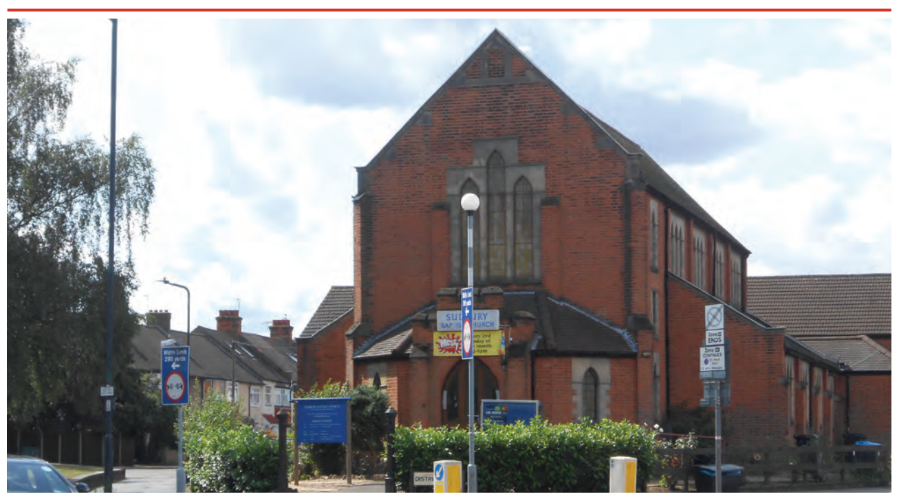
Sudbury Baptist Church 2019

Talking about St Cuthbert's Church: "The hall, I suppose it was built in the 50s (...) there was a big fundraising campaign round the parish to build the church, and we all put our, we put our, our pennies - we had penny bricks, I think to um, we were all given a sort of church bit of paper all made out into bricks and every penny you put in was signed off. And eventually the church was built (...) I had gone abroad to teach.