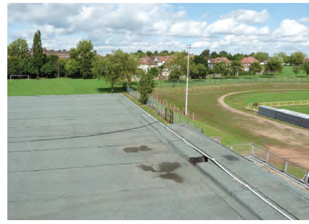
Vale Farm Sports Centre 2015

"Mobo, I'm not sure what it was called, Mobo... and it was a horse, and it was metal, and you sat on it and it sort of went up and down, you'd push with your feet and it went along. And um, I must have been quite young at the time 'cause they weren't very big, and it was a toy that probably was quite expensive. And I remember being allowed to ride on it one day and um, it fell over and it scratched,