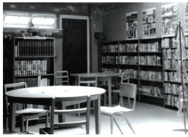
Barham Park Library interior c.1970s

"I do remember we had our sports days and um sports events at Vale Farm (...) We had