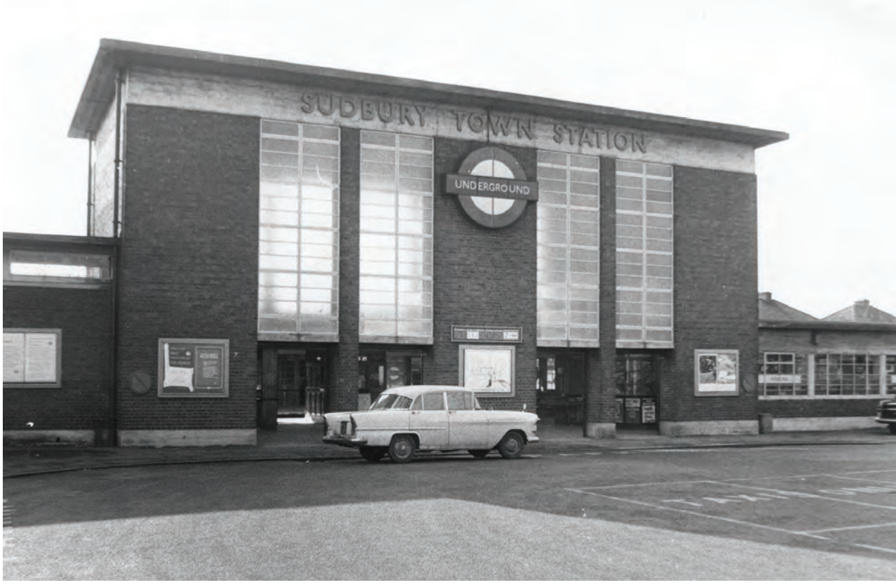
Sudbury Town Station 1970

Transport is another area that has seen radical change. Trolleybuses had both their heyday and their final usage during this time period, the bus conductors that were such a common sight for our interviewees are no more, and it's truly hard to imagine a time when you could be the first people in your neighbourhood to ever own a car!