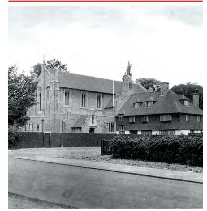
St George's Catholic Church, Sudbury 1930s

Although our interviewees represent a range of faiths, they all have one key thing in common: they have very much enjoyed the social aspects that worship in Sudbury offered them, from parades and festivals, to youth club outings and the forming of new friendships.