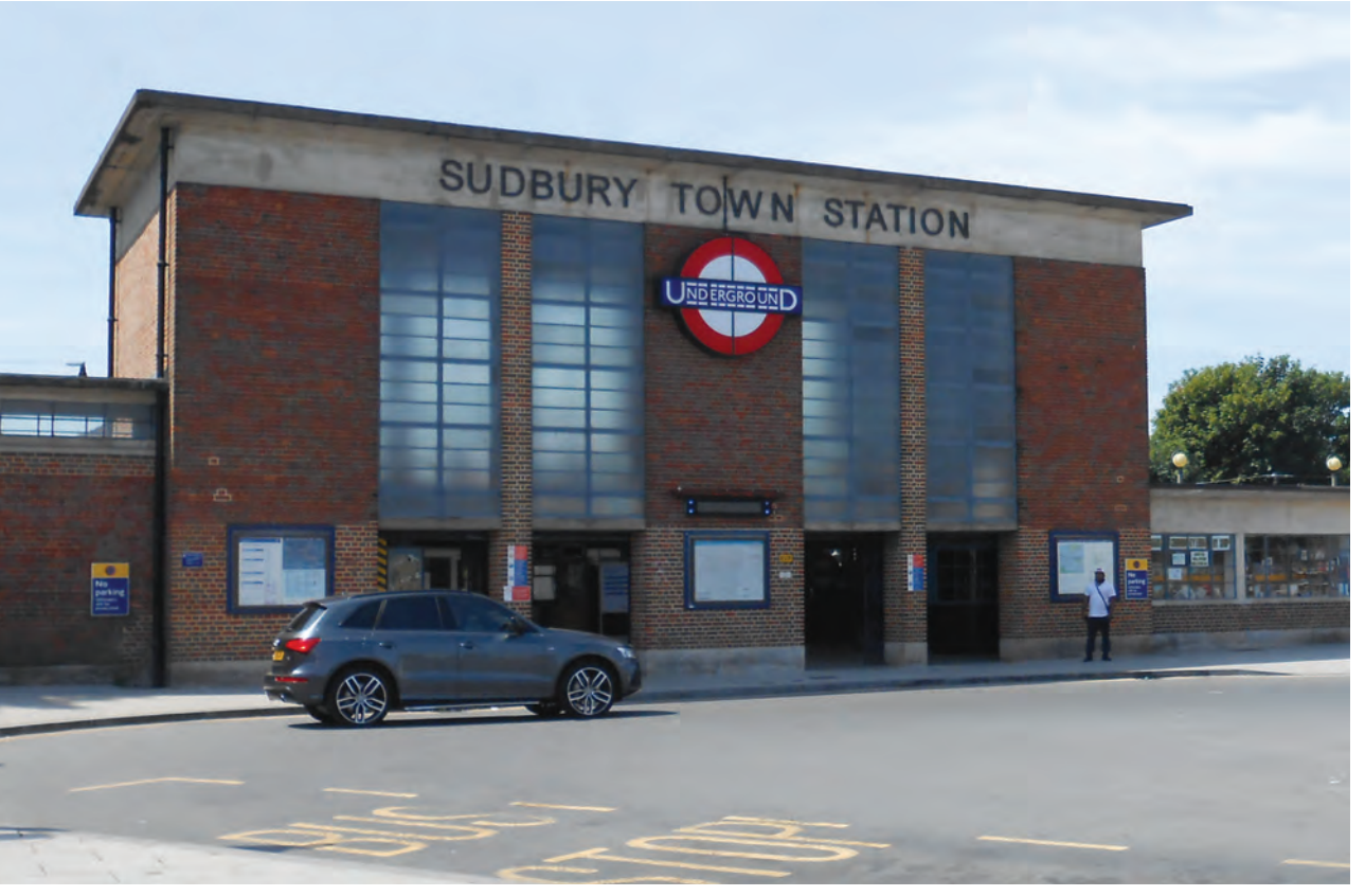
Sudbury Town Station 2019

"People wait for people to get off the open back of the routemaster bus and then you'd get on and go upstairs or downstairs and very often you'd have a, a jovial bus conductor who would have his own or her own style of doing things.