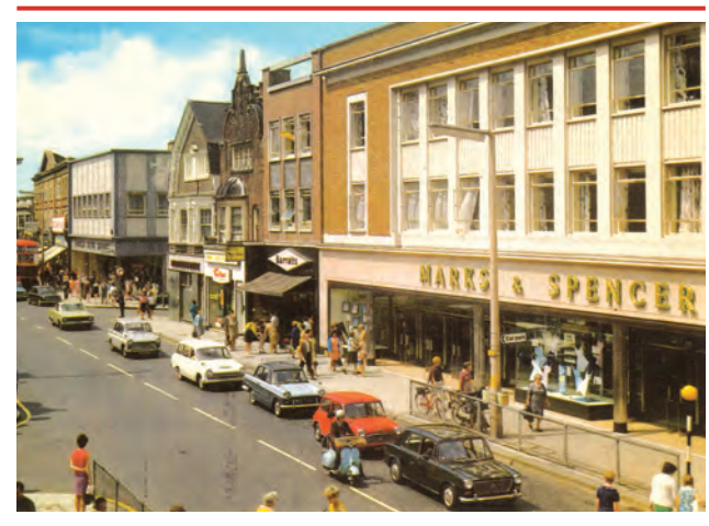
High Road, showing Mark's and Spencer's, Wembley, 1960

"My mother had a sewing machine, another electrical appliance that I'd forgotten about, um, and of course my father being in the upholstery trade, there was a lot of sewing and making and things at home. He upholstered all our own furniture, mm,