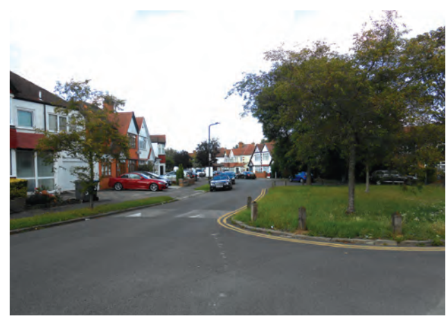
Junction of Holt Road and Dean Court, Sudbury Court Estate 2019

workshops and/or hire the Sudbury 50s-80s Loans Suitcase.