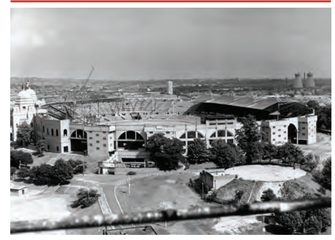
Wembley Stadium, c.1960s

"And er we did go abroad when we were, I was probably sixteen, my brother, er twelve. And I'd got some language skills by then, so just went, dad booked the ferry, and we just stopped at various places, and