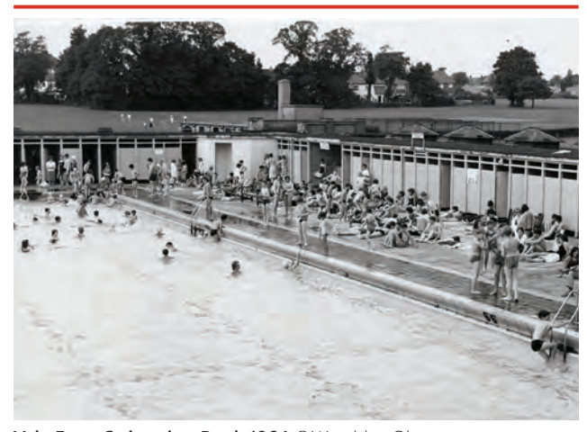
Vale Farm Swimming Pool, 1964