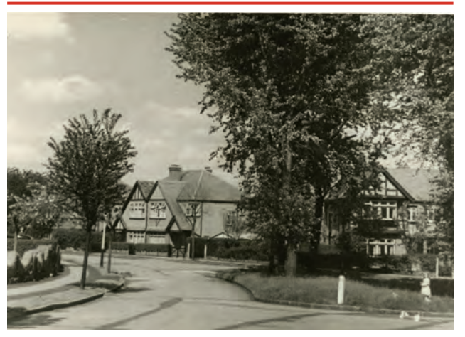
Junction of Holt Road and Dean Court, Sudbury Court Estate