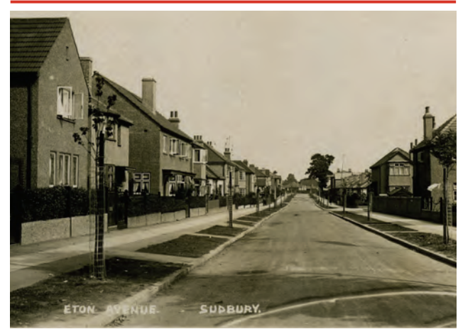
Eton Avenue, Sudbury

"I lived downstairs with my mum and my dad, so we had to share one bedroom. I slept in my mum and dad's bedroom til I was eight, um and upstairs was m my dad's aunt and also my dad's cousin and his wife and their young child, and they all shared the