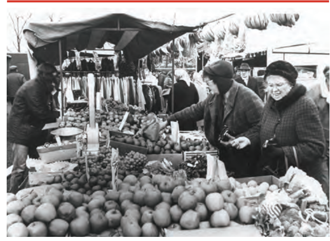
New Wembley Market 1972

"Michael would have always come back with a bag of sherbet, a sherbet suck. We used to get fizzy lemon, in a paper bag, with a a hollowed out