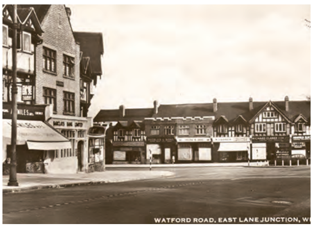
Watford Road, East Lane Junction, Wembley – Court Parade, Sudbury