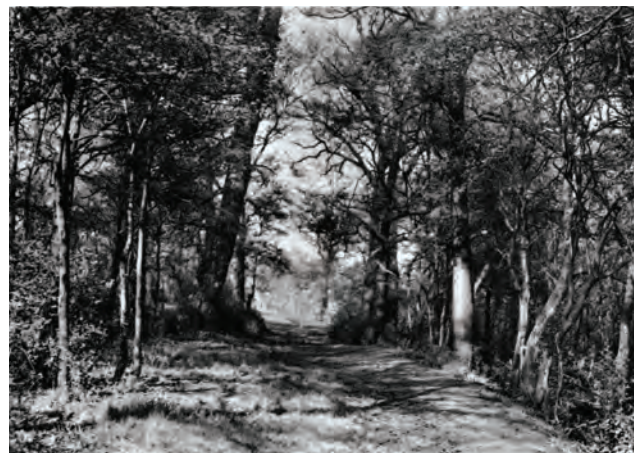
Rural path near Sudbury Golf Course, 1954

"In the back garden is we had some very tall