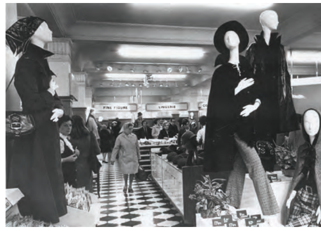
Killip's Department Store 1970

"There was also a Dairy, Unigate Dairies in um Perrin Road, almost opposite Sudbury School, um because there used to be a farm there in the old, back in the day