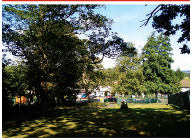
View of Harrow from Sudbury Court Road 2019

"We had television, not in the very earliest days. I think the Coronation was the big