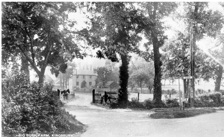
7. Bush Farm in a postcard from c.1930.

Proposed future main roads were something that local Councils had to include in the town planning schemes the government asked them to prepare in the 1920s. Kingsbury had been a separate Council area, until it became part of Wembley Urban District in 1934. Its T.P. Road No.17 was built in 1934/35, and named Fryent Way. Another of the new roads included in the 1926 scheme would have run from Slough Lane, by Bush Farm, to Fryent Way, and the kerb stones for that junction are still in place, just south of Valley Drive! All of the land between the Stanmore Line and Salmon Street was zoned for future housing development.