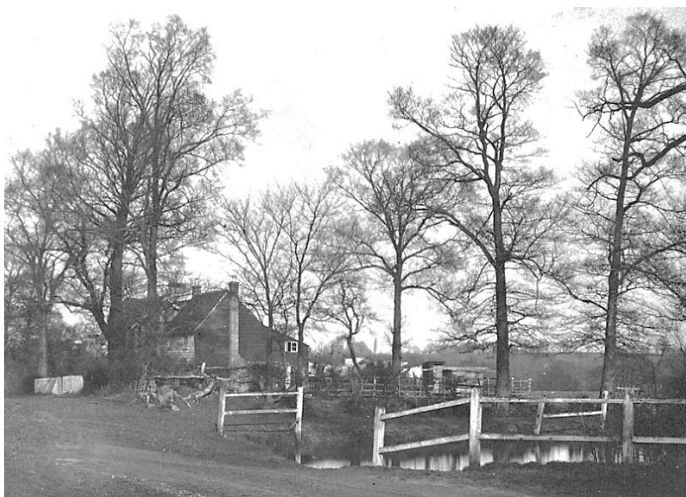
5. Hill Farm and its pond, in Salmon Street, c.1920.

On the Kingsbury side of our future country park, Masons Field in Old Kenton Lane had been sold to the London General Omnibus Company in 1928, for a sports ground. Just along the lane, another field beside the Junior Mixed and Infants' School (now Kingsbury Green) was acquired by Kingsbury Council as a recreation ground. Little Bush Farm had closed by 1930, while Hill Farm had become a horse-riding establishment, the Premier School of Equitation.