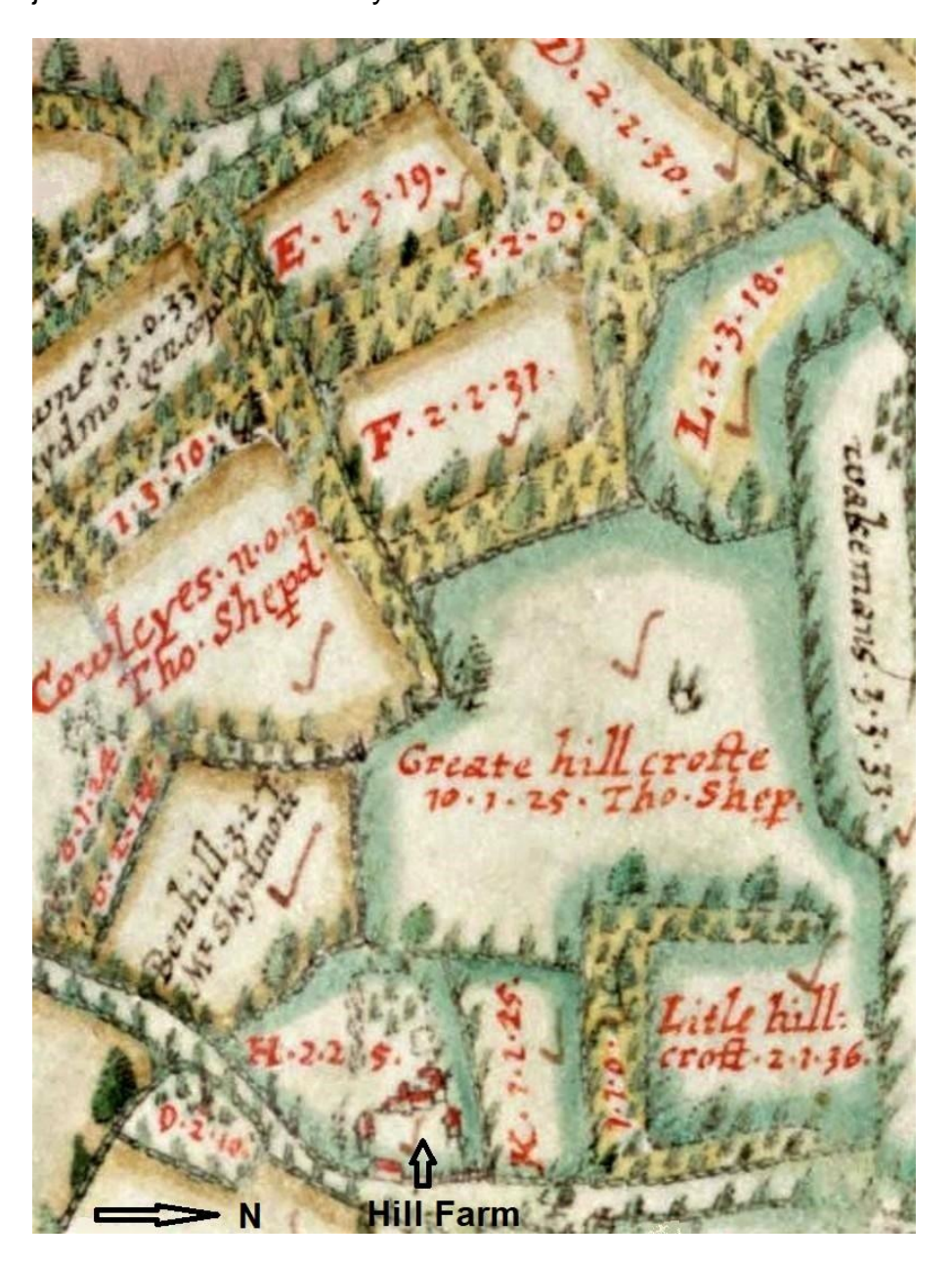
6. The Hillcroft fields on the Hovenden Map of 1597. Enjoy the walk, or at least looking forward to it, and I will take up the story again next week.

The map extract below shows the farm and the Hillcroft fields, and you can walk across this part of Fryent Country Park along a footpath. Treat the short section of Eldestrete, in the top left corner of the map, as if it were Fryent Way. At the brow of the hill you will find the footpath, which takes you along the ridge, with lovely views over the fields, to Salmon Street, near its junction with Mallard Way.