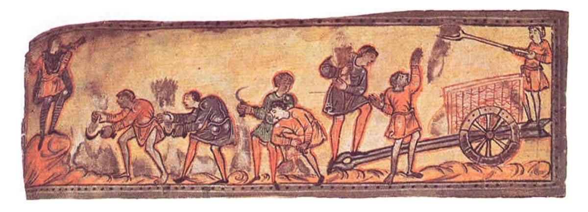
2. Harvesting in the 11th century. (From a manuscript, probably in the British Library)

When were people first living on what is now the country park? There is evidence that there was a farm in Roman times near Blackbird Hill. An ancient trackway, that crossed the River Brent (a Celtic name) by a ford at the bottom of the hill, continued northwards, just to the west of the modern Fryent Way. You can follow it as a footpath, branching off on the left about 100 metres north of the Salmon Street roundabout. The Saxons called this route "Eldestrete" (the old road), and in the 10<sup>th</sup> century they used it to mark the boundary between Harrow parish (where the land was owned by the Archbishops of Canterbury) and "Kynggesbrig", now Kingsbury (a place belonging to the King).