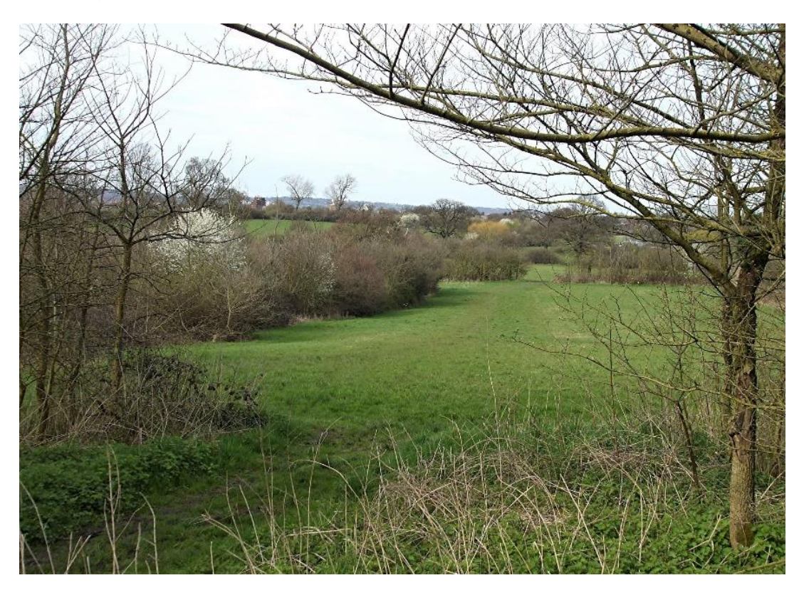
1. Looking north across Little Hillcroft Field, towards Kingsbury.

Some of you may be thinking of our beautiful local country park as a peaceful place, where you can go for fresh air and exercise while still "social distancing". Others are looking forward to spending some time there, once we are no longer asked to 'stay at home'. But have you ever wondered how we came to have this special open space, or what it was like here 100 or 1,000 years ago? Over the next few weekends I hope to share its story with you.