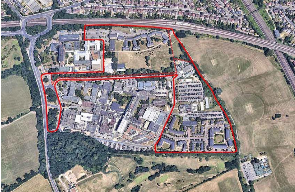
Figure 1: Land relevant to the NPP and the emerging allocation BNWAG1 'Northwick Park Growth Area'.

Having reviewed the draft Local Plan, The NPP is supportive of the Council's strategic aims and policies, especially in relation to the promotion of sustainable development.