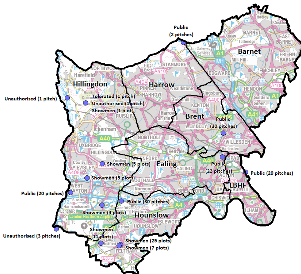
Map 1 – Location of Sites and Yards